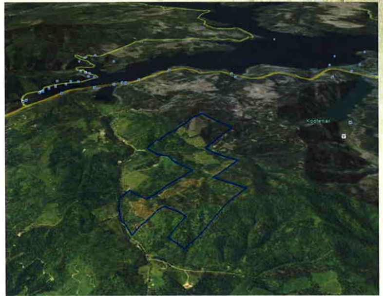
A birds eye view of the site from the northeast provides a better understanding of the role Lake Coeur d'Alene plays as a regional destination. (Google Earth, north is to the bottom right.)

The location of this large, diversely terrained parcel is perfectly suited for large-scale real estate developments, high-end luxury developments or upscale multi-acreage second home retreats.