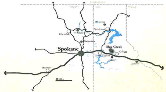
Our Blue Creek site is within 45 minutes of Spokane International Airport which offers connecting flights to most global destinations. The region also offers multiple ski resorts and many water activities. (Studio Cascade)